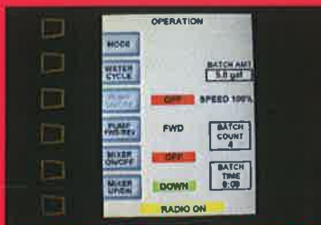
FULLY ELECTRONIC CONTROL