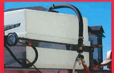
AUTO-FILL TANK VALVE