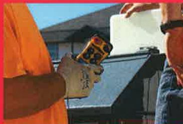
OPTIONAL WIRELESS REMOTE